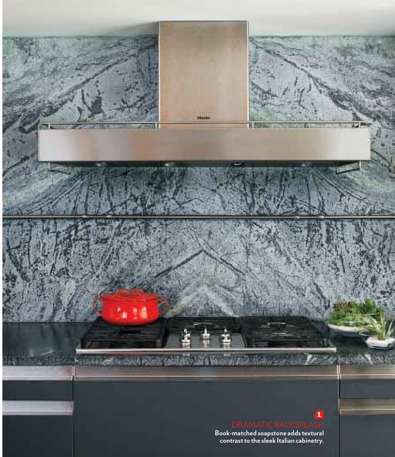
1 DRAMATIC BACKSPLASH Book-matched soapstone adds textural contrast to the sleek Italian cabinetry.